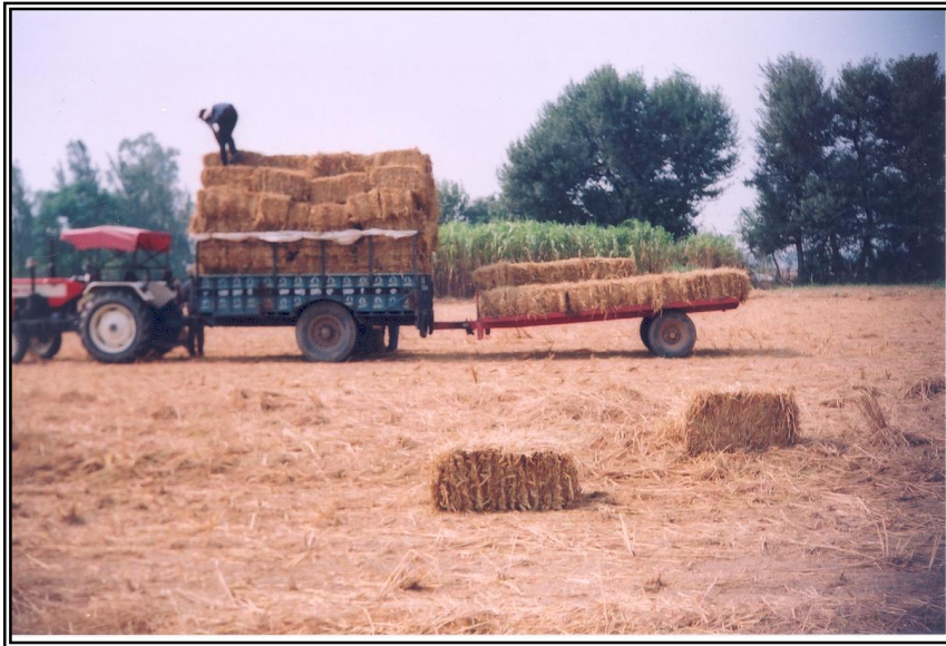
Fig.1.4. Transportation of Bales