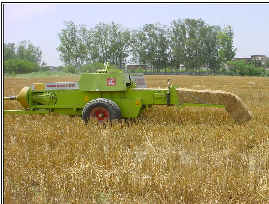
Fig. 1.3. Straw Baler in Operation in Combine-harvested Paddy Field

The cost of twine used in tying of the bales was Rs. 525.00 per hectare and the cost of transportation came out to be Rs. 4400.00 per hectare. Very high cost of transportation of the bales is one of the main reasons that the straw balers are not gaining popularity among farmers. Economics of straw baler showed that the cost of operating the baler in combine-harvested paddy field including the cost of twine was Rs. 2008.00 per hectare and for operating stubble shaver was Rs. 268.00 per hectare (Table 1.7). Thus the total cost of operating straw baler in a stubble-shaved field came out to be Rs. 2276.00 per hectare. The cost of transportation of bales by tractor-trailers was Rs. 4400.00 per hectare. Therefore, the total cost of baling in stubble-shaved field including transportation of bales was Rs. 6676.00 per hectare. The total income from the sale of straw @ Rs 600/ton comes out to be Rs 5865/ha, which is less than the total cost of operation of Rs 6676/ha. Thus, cost of transportation is the major contributor to the total cost of using straw baler as a possible method of paddy straw management.