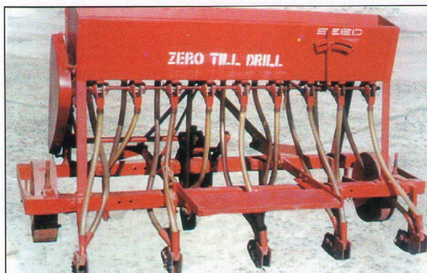
Fig 1 Tractor mounted zero till seed cum fertilizer drill

The Tractor mounted zero-till seed drill was initially developed at GB Pant University of Agriculture and Technology, Pantnagar and subsequently modified to the site needs (Fig.1).