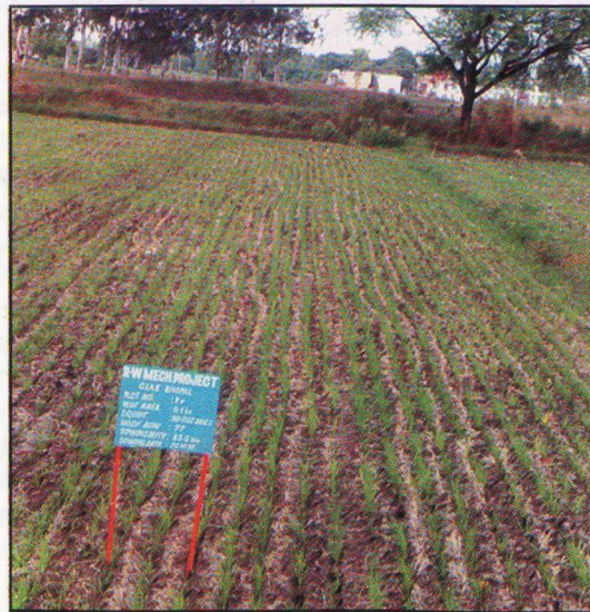
Fig 4 Zero-till drilled wheat (LOK-1) at 15 days of sowing