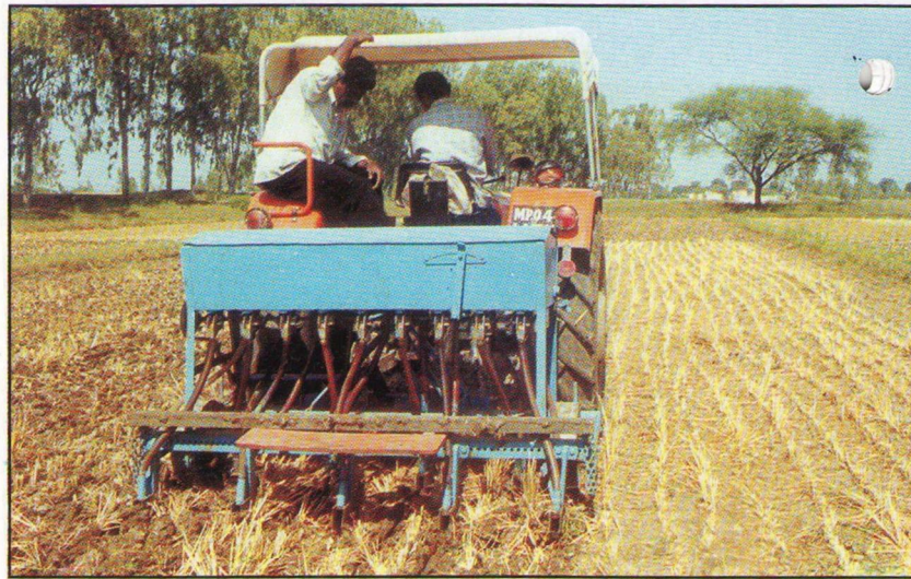
Fig 3 Field testing of zero-till drill for sowing of wheat after harvest of rice