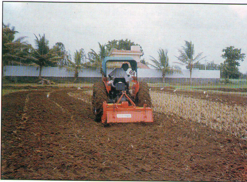
Fig 3 Field testing of Tractor mounted rotavator for seedbed preparation (dryland)

JNKVV, Jabalpur; PDKV, Akola; ANGRAU, Hyderabad; GBPUAT, Pantnagar; HAU, Hisar; KAU, Tavanur and MPKV, Pune centres carried out feasibility testing of tractor mounted rotavator covering about 250 ha area (Fig 3).