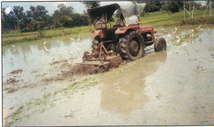
Fig 2 Field testing of Tractor Mounted rotavator for puddling of paddy fields at JNKVV, Jabalpur